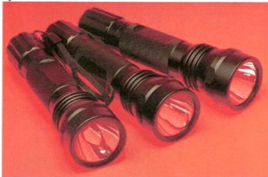
Figure 1 General view of torches

Ultraviolet radiation (UVR) emissions from three Ace UV Blacklight Torches incorporating light emitting diodes (LEDs) have been measured, under contract to Redweb Security (UK) Ltd., in order to identify potential optical radiation hazards to persons exposed to the beam from the torches. Each torch incorporates a single LED and rear reflector protected by a transparent front cover (see figures 1-3).